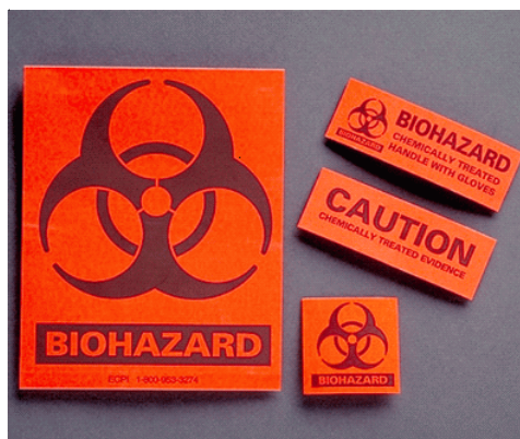
Examples of biohazard labels.

If you generate more than fifty pounds of infectious waste in a month, you must register with Ohio EPA as a large infectious waste generator. Large generators cannot put untreated infectious waste in their dumpster. They must ensure that the waste is properly treated either on-site, or shipped off-site to a licensed infectious waste treatment facility.